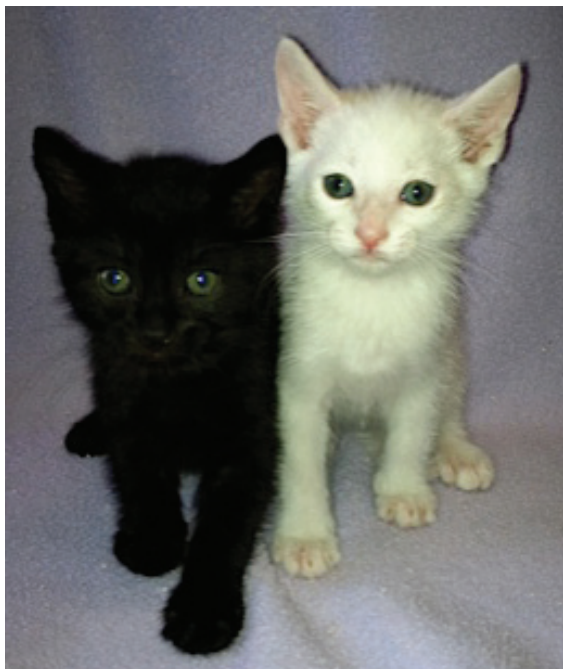
Yin and Yang

Be kind. Save a life. Support animal rescue. •