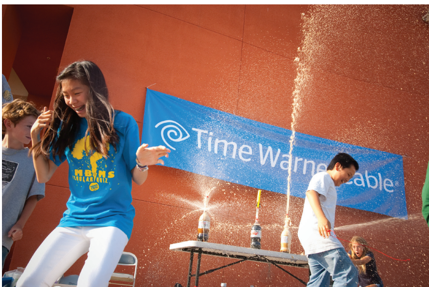
Above: Manhattan Beach Middle School students launch their experiments center stage.