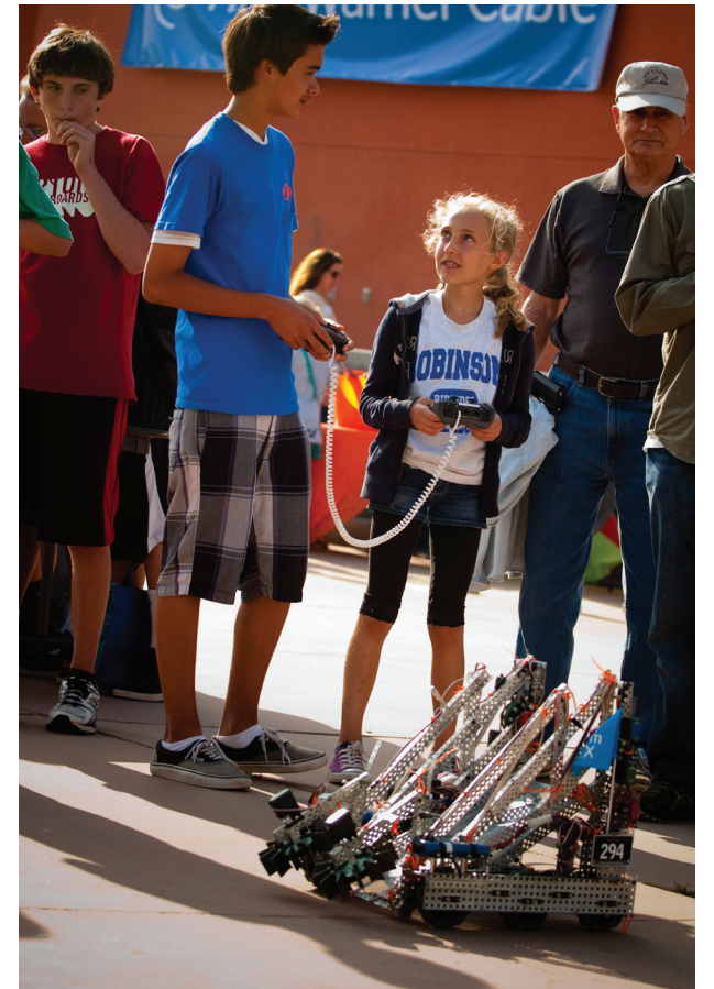
Above: Manhattan Beach middle school students prepare to launch their project!