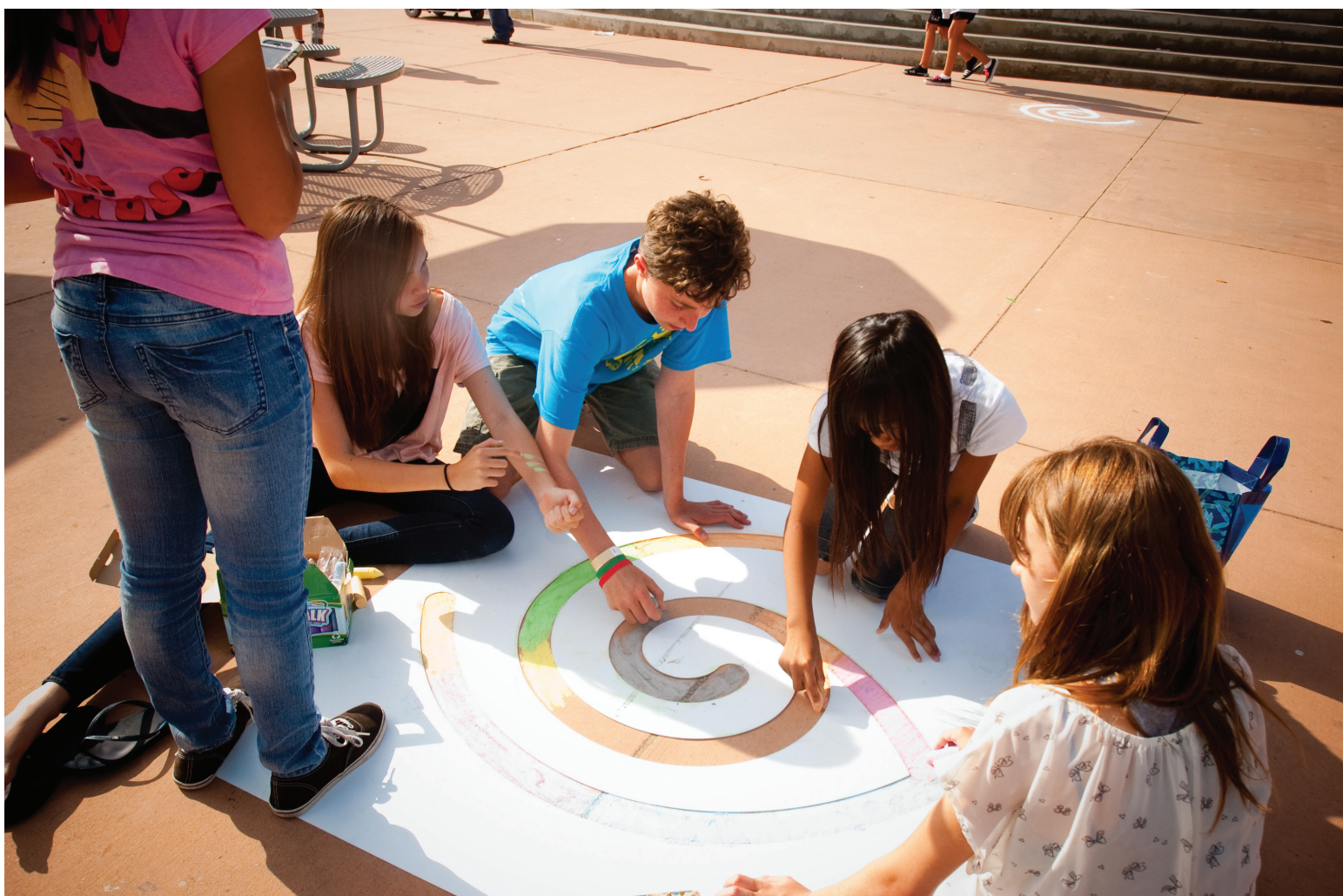
Above: Manhattan Beach Middle School students fill in Time Warner Cable stencils to guide Science Night attendees throughout the event