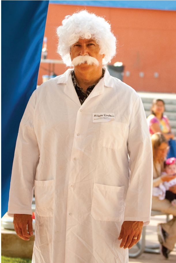
Above: Albert Einstein makes an appearance at the Manhattan Beach Middle School Science Night hosted by Time Warner Cable and the Manhattan Beach Education Foundation

Time Warner Cable hosted the Manhattan Beach Middle School Science night, along with the Manhattan Beach Education Foundation, as part of Time Warner's five-year $100 million initiative, Connect a Million Minds, to increase science, technology, engineering and math education for youth. The students and parents of Manhattan Beach enjoyed the evening's activities that included fingerprints with the local police department, elephant toothpaste, the Time Warner Cable "Ask a Tech" booth, and more. The event, shared with more than 700 children and parents, featured 54 workshops, demonstrations, and presentations, and 190 volunteers. Simply by inspiring young people to be curious, this event looks to contribute to the future career paths of the next generation. Photos courtesy of Time Warner Cable. •